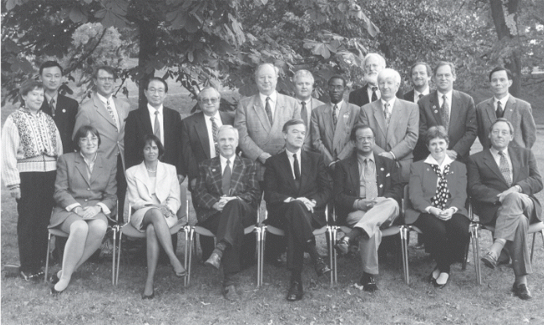
The Board of ICOH Congress in Stockholm.