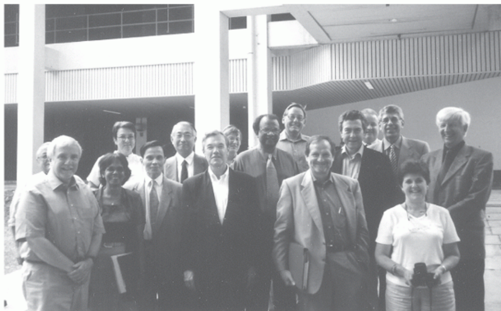
ICOH Board in Singapore in August 2000.

But, in fact, this is essentially the community of researchers and occupational health professionals, i.e. physicians, nurses, engineers and safety technicians, hygienists, ergonomists, psycho-sociologists, etc. within the Office, the Board, the Scientific Committees and all ICOH Members who have generously participated in the construction of knowledge and its application. This also includes those non-members involved in the day-to-day management of occupational health services. It is these individuals, who have been responsible for performing most of the work, that I would like to address in order to convey my sincere appreciation with the hope that they will pursue their tasks with utmost confidence and tenacity.