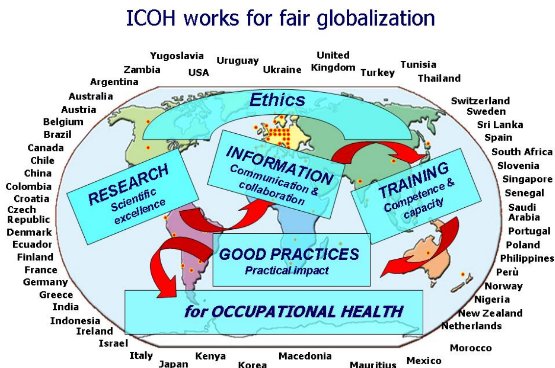
Figure 1. Five main elements in the ICOH mission.

Most of ICOH mission is implemented through its activities in Scientific Committees, Special Committees, Task Groups and Working Groups and, if needed, in ad hoc-groups. The ICOH Newsletter and website, as well as various publications serve the information mission. ICOH organizes triennial world Congresses, which are the main international inventory of research in occupational health in the world, attracting usually 2000–3000 participants and presenting some 1500–2000 research communications of different types. The ICOH mission can be illustrated as in Figure 1.